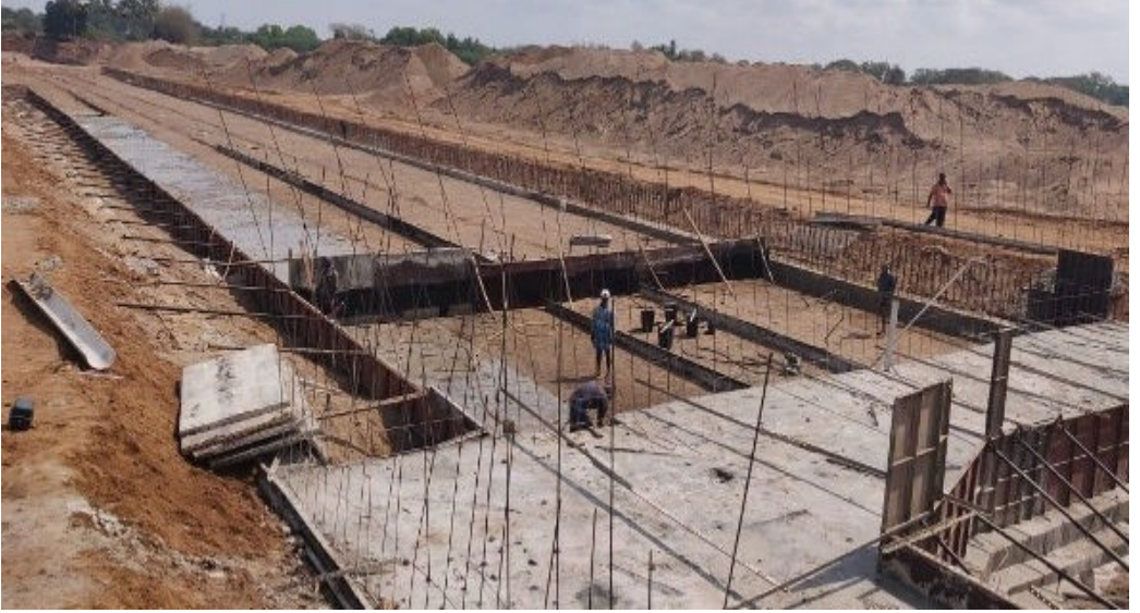
Construction of Check dam across Vellar River at a cost of Rs.22.50 crore from District Mineral Foundation Trust Fund in Cuddalore District